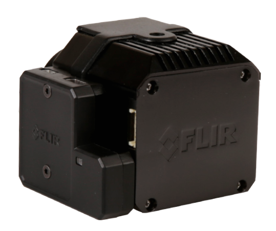
Vue Pro with Optional Power & HDMI Video Module attached